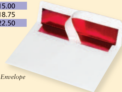
Fastick® Envelope sample

* For quantities not listed, see the note below the Volume Discounts chart.