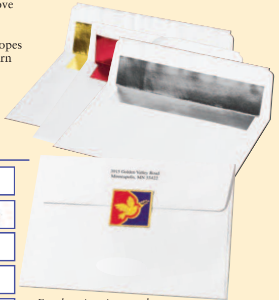
Envelope imprint sample