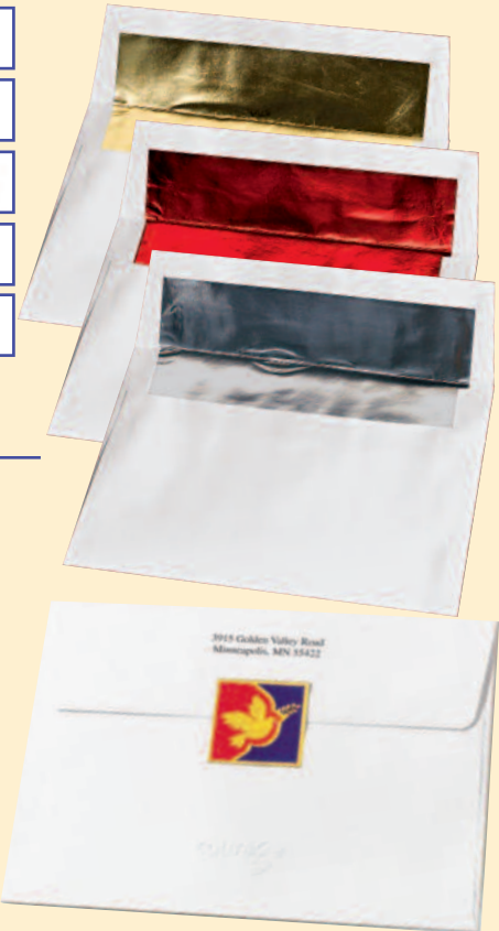
Envelope imprint sample