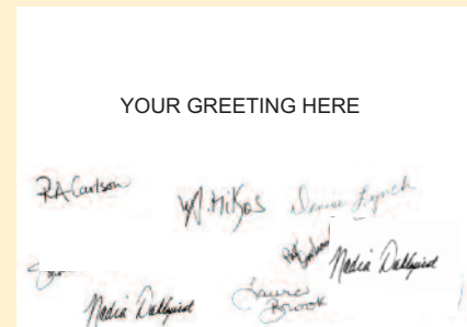
Signature imprint sample